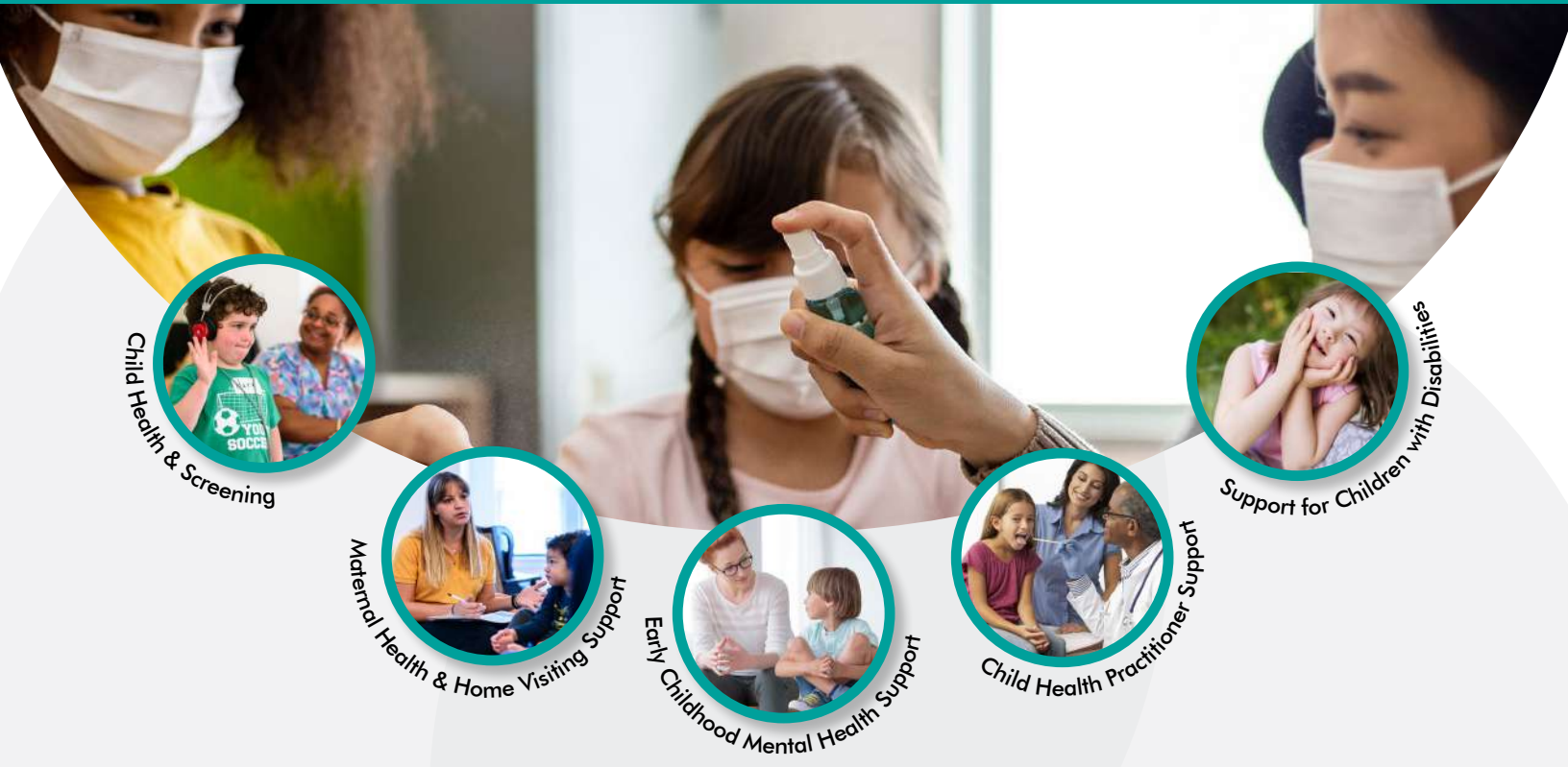
Child Health & Screening